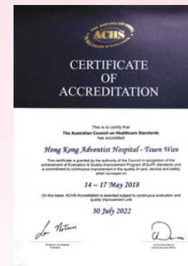
Australian Council on Healthcare Standards 澳洲醫療服務標準委員會