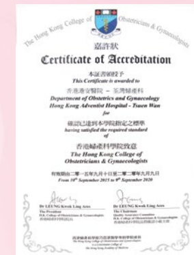
Hong Kong College of Obstetricians and Gynaecologists 香港婦產科學院